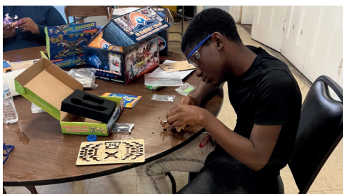
Stewpot Teens learn about Artificial Intelligence during Summer Camp