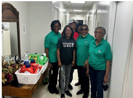
Volunteers visit the ladies of Matt's House and deliver cleaning supplies