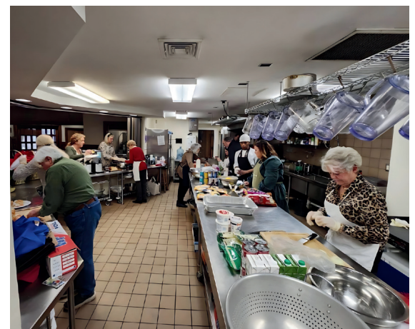
Volunteers from St. Andrews Episcopal Cathedral prepare meals for the Opportunity Center