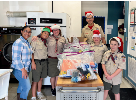
Cub scouts deliver care packages to the Opportunity Center