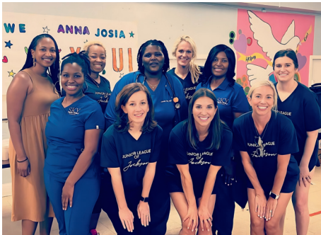
Junior League of Jackson participates in Lunch & Learn series with Stewpot Kids & Teens

In 2024, our hard work will continue with 4,634+ of our dearest friends by our side. Thanks be to God for each of you and Thanks be to God for our Stewpot community.