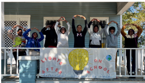
Stewpot Teens observe Lights On Afterschool, a nationwide event highlighting afterschool programs and their impact on the community