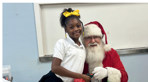
The After-School Kids Program enjoys a visit from Santa at their Christmas party