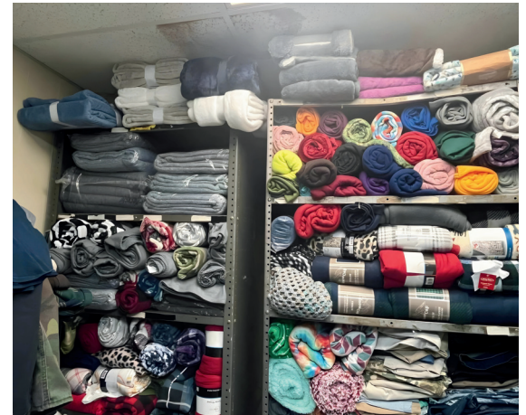
Mississippi United to End Homelessness (MUTEH) donates blankets to the Opportunity Center

Six days a week (Monday-Saturday), the Opportunity Center offers laundry service, showers, mail service, and computer and phone access, as well as toiletries, snacks, coffee, and community. Case management is available on-site to connect visitors with resources like housing, employment, mental health services, medical care, and other specific needs.