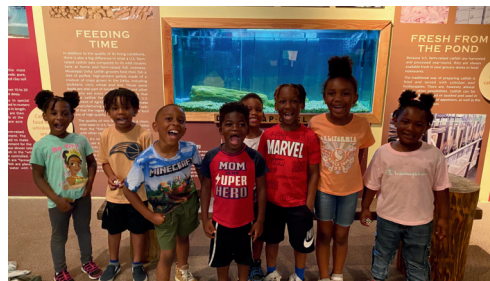
Stewpot Kids take a field trip to visit the Mississippi Agriculture & Forestry Museum during Summer Camp