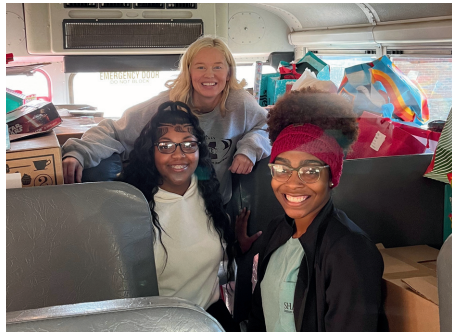
Wee the People store in Madison, MS organizes food drive for Stewpot Food Pantry