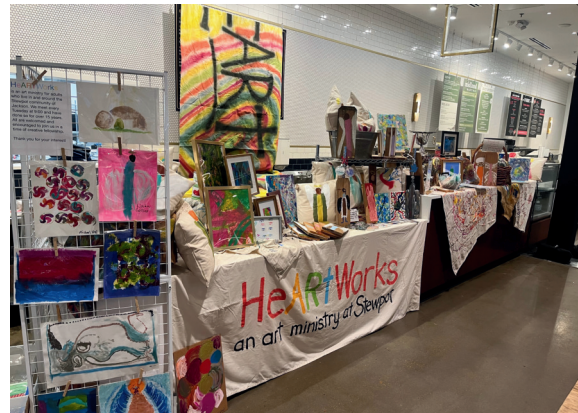
HeARTworks artists sell their art at Deck the District, the District at Eastover's annual holiday festival