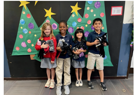
Second Graders at St. Andrews Lower School collect gloves for Stewpot shelters & Clothing Closet